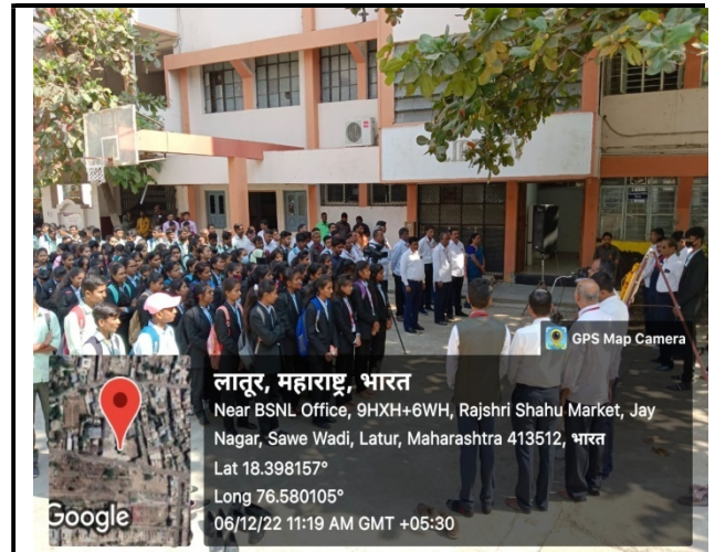
Students participated on the occasion of Mahaparinirvan Din program.